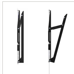
Fixed tilt at 00, 50, 100 and 150