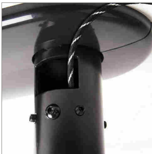
Integrated cable management for a neat and tidy installation