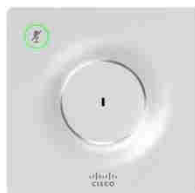
Figure 3. Cisco Table Microphone 60