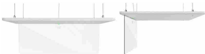
Figure 4. Cisco Ceiling Microphone