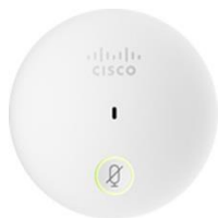
Figure 1. Cisco Table Microphone

Cisco microphones provide a range of audio coverage solutions for both integrated video systems and custom video deployments - either on the table or discreetly through the ceiling (Figures 1 through 5). The microphones are optimized for voice and designed for use in small-to-large collaboration meeting rooms and specialized spaces with state-of-the-art audio quality.