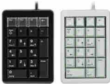
Models may vary from the image shown