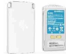
Battery (3300 mAH)