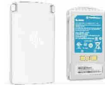
Battery (3300 mAH)