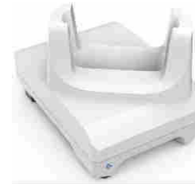
Low-Cost Single Slot Charge Only Cradle CRD-TC2W-BS1CO-01