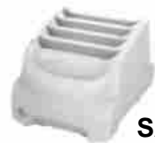
4 slot Battery Charger SAC-TC2W-4SCHG-01