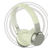
Lenovo Yoga Active Noise-cancellation Headphones