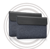
Lenovo Yoga Sleeves (14" and 15")

* Example of Lenovo catalogue naming convention