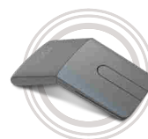
Lenovo Yoga Mouse with Laser Presenter