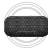
Lenovo 700 Ultraportable Bluetooth® Speaker

* Example of Lenovo catalogue naming convention