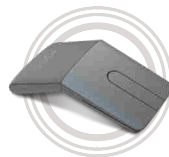
Lenovo Yoga Mouse with Laser Presenter