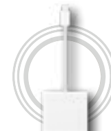
Lenovo USB-C 3-in-1 Hub