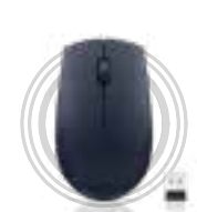
Lenovo 520 Wireless Mouse