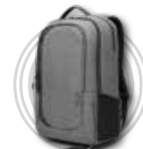
Lenovo 17" Laptop Casual Backpack B730