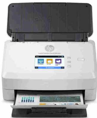
HP ScanJet Enterprise Flow N7000 snw1

Give your office high-volume scanning performance. HP Scan Premium helps you save time and capture confidently. Achieve black-and-white scan speeds up to 75 ppm/150 ipm 1 . Recommended for 7,500 pages per day.