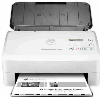
HP ScanJet Enterprise Flow 7000 s3