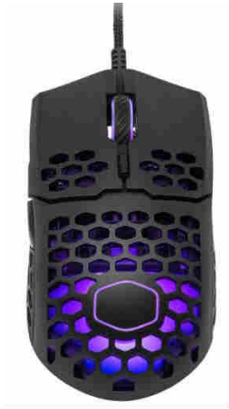
Model: MM711 Black Matte P/N: MM-711-KKOL1