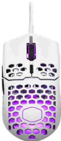
Model: MM711 White Matte P/N: MM-711-WWOL1