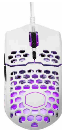
Model: MM711 White Glossy P/N: MM-711-WWOL2