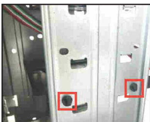
Inserting the Plastic Pegs into the Computer Chassis