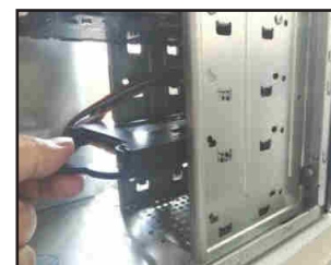
Sliding the Mounting Bracket into the 3.5" Hard Drive Slot