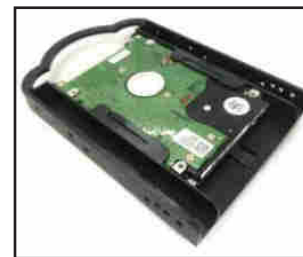
Inserting a Hard Drive into the Mounting Bracket