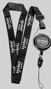
Lanyard - Black AC4100-1692