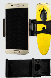
Scanner & Phone Holder