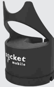
Charging Dock SKU# AC4133-1871