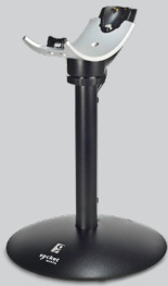
Charging Stand SKU# AC4076-1538