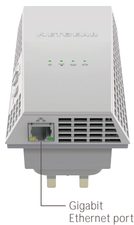
Gigabit Ethernet port