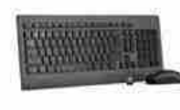
Lenovo Wireless Mouse Keyboard