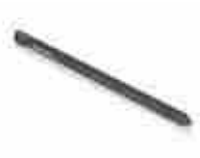
Lenovo 500e EMR Pen