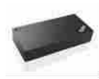
ThinkPad USB-C Dock