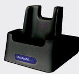
• 94ACC0208 Single Slot Dock Charge only