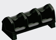
• 94ACC0206 3-Slot Dock