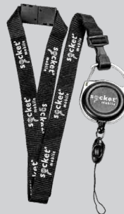
Lanyard - Black AC4100-1692