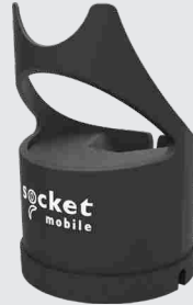
Charging Dock SKU# AC4133-1871