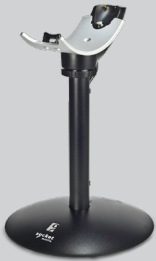
Charging Stand SKU# AC4076-1538