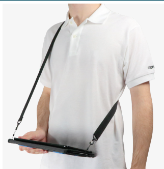
For typing in standing position