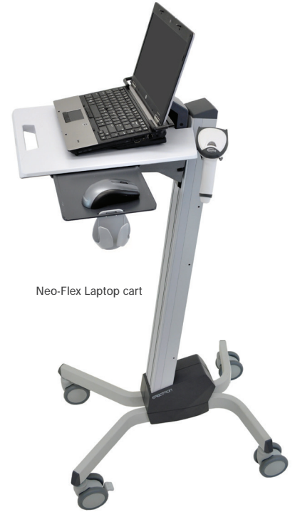
Neo-Flex Laptop cart