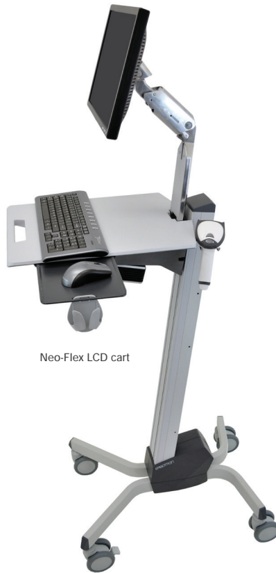
Neo-Flex LCD cart