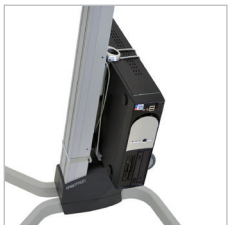
UNIVERSAL CPU HOLDER 80-105-064 (DARK GREY)