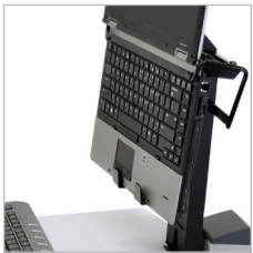
NF CART LAPTOP VERTICAL KIT 97-546