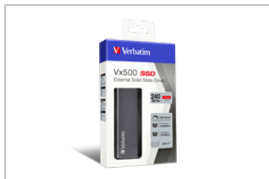
47442 Packaging 3D