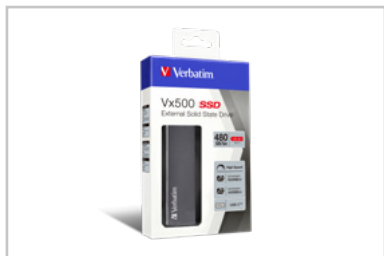
47443 Packaging 3D