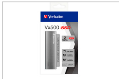
47454 Packaging Flat