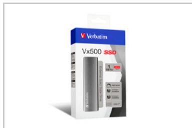
47444 Packaging 3D