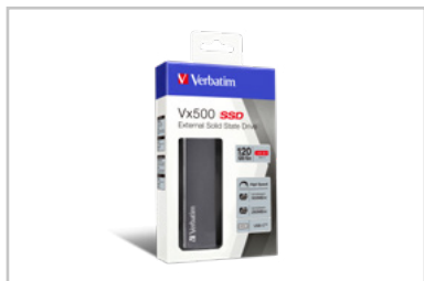
47441 Packaging 3D