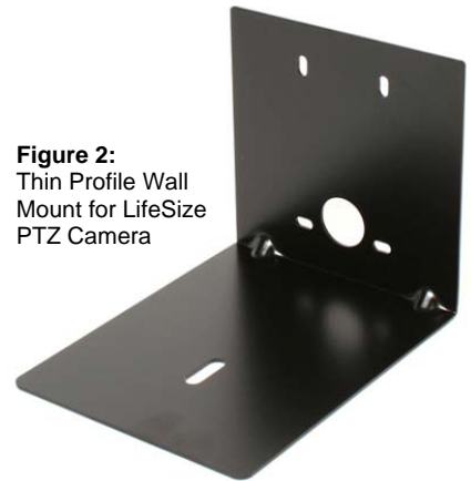
Figure 2: Thin Profile Wall Mount for LifeSize PTZ Camera

Please see the Vaddio website at http://www.vaddio.com for the Vaddio Statement of Warranty for all Vaddio Products. The Statement of Warranty covers the policies and procedures of the Hardware Warranty, Exclusions, Customer Service, Technical Support, Return Material Authorizations (RMA), Voided Warranty, Shipping and Handling and Products Not Under Warranty. The Vaddio Warranty Statement supercedes all other published warranty statements in content and coverages. Vaddio Technical Support can be contacted through the Vaddio website or through e-mail support at mailto:support@vaddio.com .