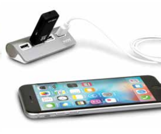
Plug up to 4 USB devices at the same time Branchez jusqu'à 4 périphériques USB en même temps