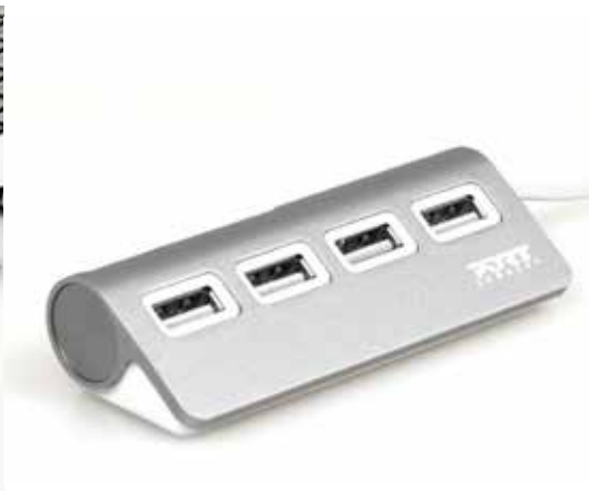
Super fast USB 2.0 hub with high quality aluminium body Hub USB 2.0 ultra rapide avec corps en aluminium de qualité