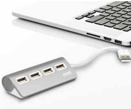
Allows to transfer your data and charge your devices Permet de transférer vos données et charger vos appareils