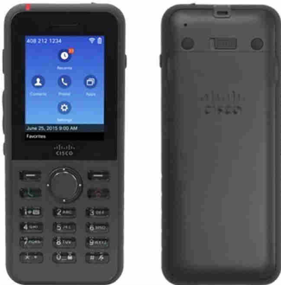
Figure 1. Cisco Wireless IP Phone 8821