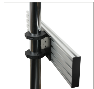
Use BT8390-CFK collar fixing kits and B-Tech collars & poles to create ceiling or oor-to-ceiling installs