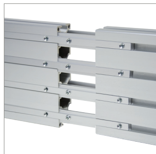
Multiple lengths can be joined together using BT8390-EXT (available separately)