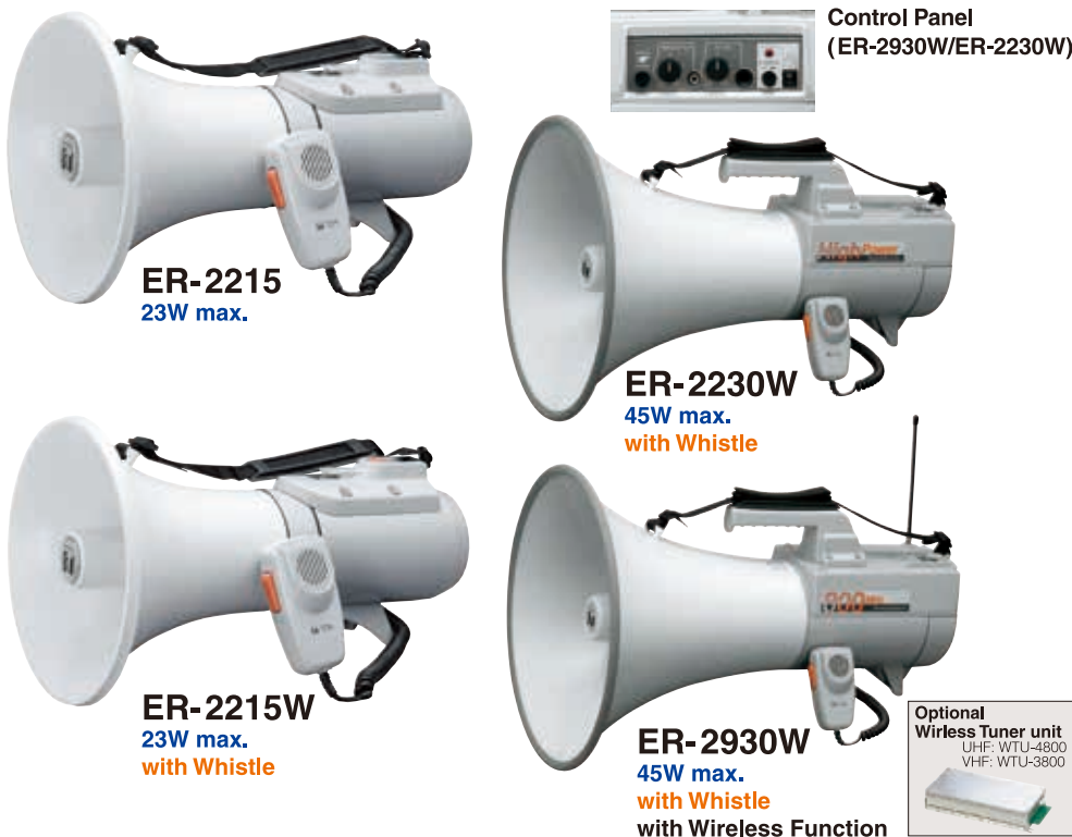
ER-2215 23W max.