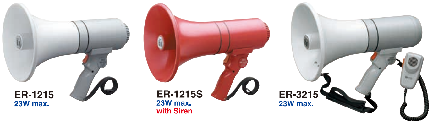
ER-1215 23W max.