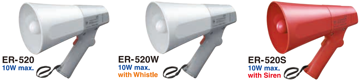
ER-520 10W max.