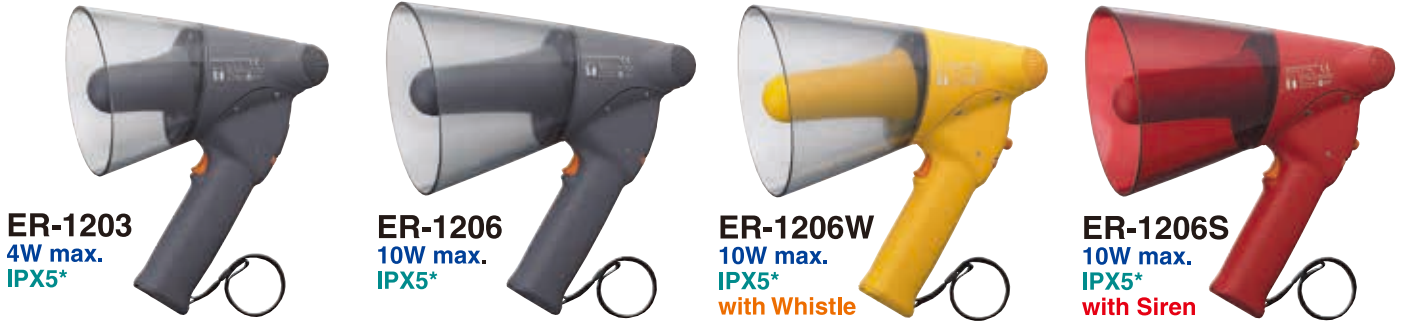
ER-1203 4W max. IPX5*