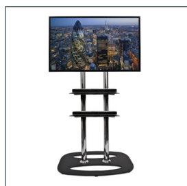
Mount additional shelves as required