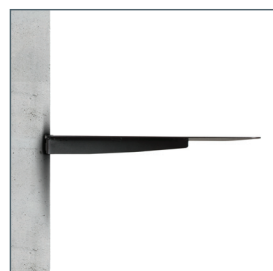
Can also be wall mounted (Wall fixings not included)