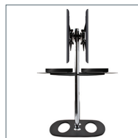
Shelves can be back-to-back pole mounted with just 1 set of collars