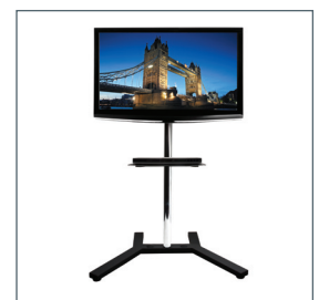
Can also be mounted to a single pole using 1 collar