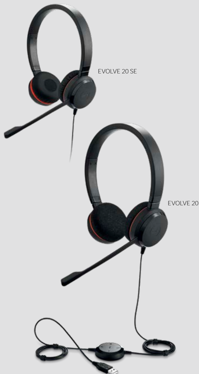
EVOLVE 20 SE