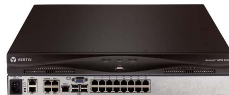
Avocent MergePoint Unity™ 32-port switch