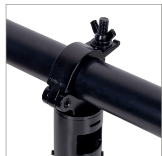
Fits truss systems from 42mm up to 50mm