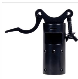
Wing-nut fitting allows quick release of the clamp from the pole