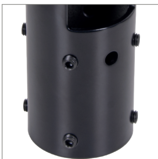
Grub screws allow micro-adjustment of the pole angle once mounted