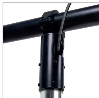
Integrated cable management for a neat and tidy installation