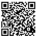
B360 3D demo