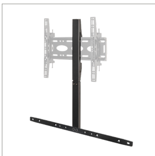
Use with a BT7031 adaptor to mount onto a range of B-Tech flat screen mounts.