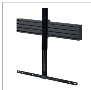
Use with a BT8390-SA to mount speakers onto a BT8390 rail.