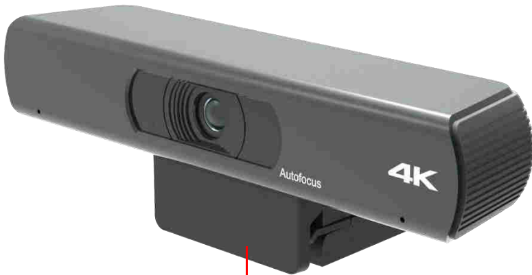
Standard Mounting Bracket

1.1 With this mounting bracket, user could mount the JX1700(U) model on the top of the monitor and touch screen.