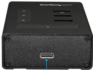
USB Type-C™ port (data only)