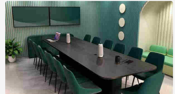
MEETING OWL 3 + MEETING OWL 3