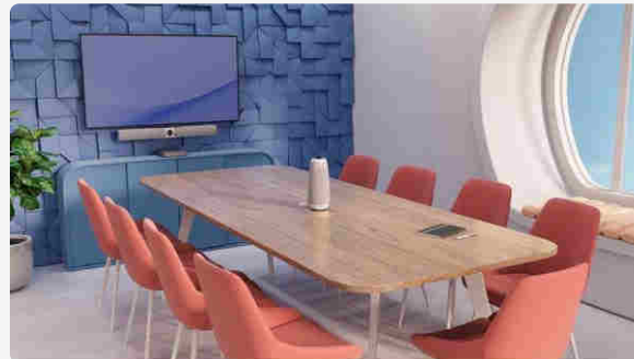
Meeting Owl 3 + Owl Bar

Wirelessly pair with the Owl Bar or a second Meeting Owl for collaboration in larger spaces