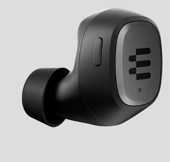
GTW 270 Series Frequently Asked Questions