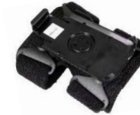
Wearable Arm Mount