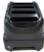
4 slot Battery Charger