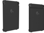
Batteries (3100 mAh, 5400 mAh)