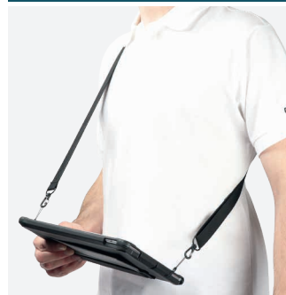
For typing in standing position