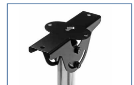
Cathedral Ceiling Plate (Included)