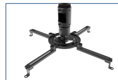
Universal Spider® Adaptor (Included)