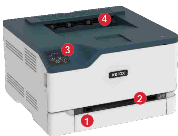
Xerox® C230 Colour Printer