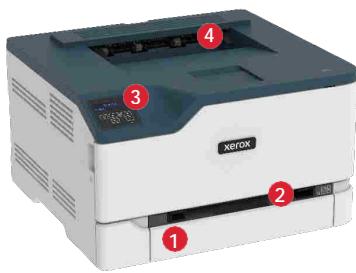
Xerox® C230 Colour Printer