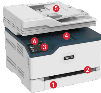
Xerox® C235 Colour Multifunction Printer