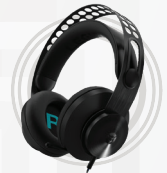
Lenovo Legion H300 Gaming Headset

* Example of Lenovo Legion catalogue naming convention