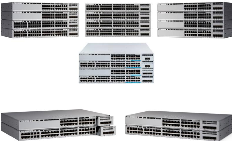
Figure 1. Cisco Catalyst 9200 Series switches

The Cisco Catalyst 9200 Series is made up of modular (C9200) and fixed (C9200L) switch models.