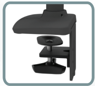
INCLUDED: STANDARD 2-PIECE DESK CLAMP ATTACHES TO SURFACE EDGE