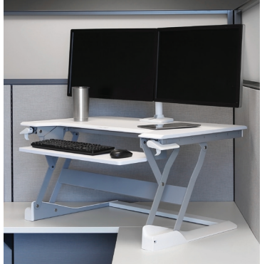
SHOWN WITH WORKFIT-TL SIT-STAND WORKSTATION

THE LOW-PROFILE MONITOR CROSS-BAR PROVIDES A COMPACT RANGE OF MOTION