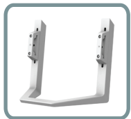
RECOMMENDED ACCESSORY: LX DUAL DIRECT HANDLE KIT 98-037-062