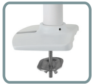
GROMMET MOUNT KIT ACCESSORY 98-034: ATTACHES THROUGH SURFACE HOLE