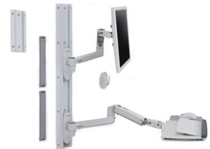
LX Wall Mount System, White