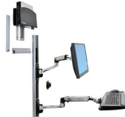
LX Wall Mount System