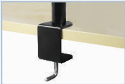
Desk Edge Mounting

Pole x 1 / Mounting Arm x 1 / Clamp x 1 / Hex Key x 2 / Cable Hook x 2 / Rubber Pad x 1 / Spacer x 4 / Cable Clip x 1 / Screw x 19 / Manual x 1