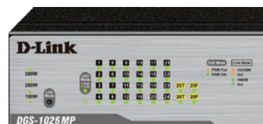
PoE usage LEDs

The DGS-1026MP features 24 10/100/1000BASE-T ports that support the IEEE 802.3at+ PoE standard. Each of the 24 PoE ports can supply up to 30 W, with a total PoE budget of 370 W, allowing users to attach multiple IEEE 802.3at-compliant devices to the DGS-1026MP without requiring additional power sources. Power over Ethernet is especially suitable for powering devices that are too far away from power outlets or for minimising the clutter of extra cables. The PoE usage LEDs further provide real-time feedback on the current PoE power usage on the network and helps plan out the PoE network budget, preventing PoE overloading problems.