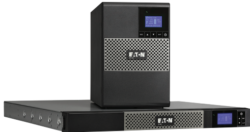
Available in tower and rack 1U format