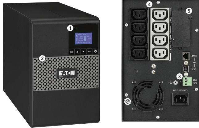
Eaton 5P 1550i UPS