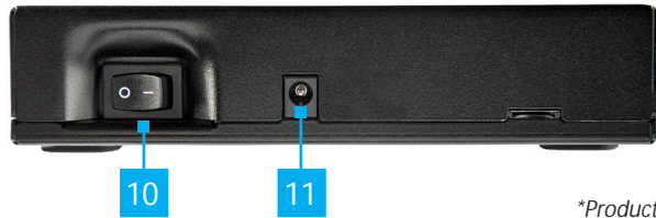
Top Edge View