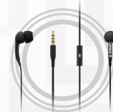
Lenovo 100 In-Ear Headphone