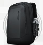
Lenovo 15.6" Laptop Casual Backpack B210